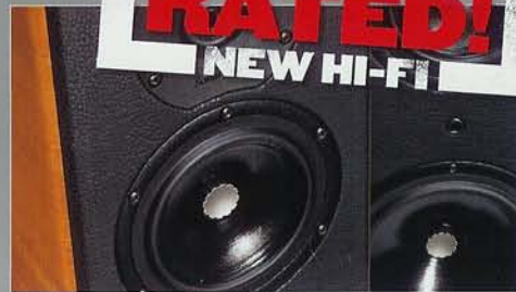
Sonus Faber Concerto Domus Italian luxury you can afford