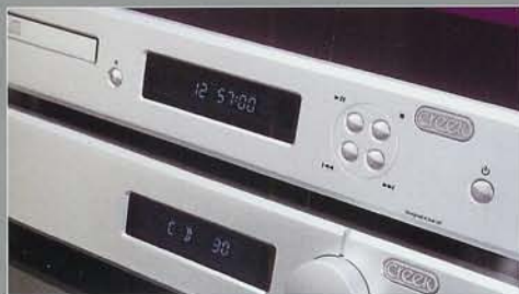
Creek EVO CD and amplifier The new budget benchmark?