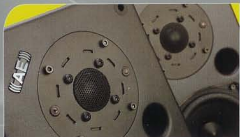
Acoustic Energy AE1 Classic The return of a masterpiece